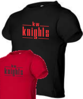
Design P38Red or P38Black